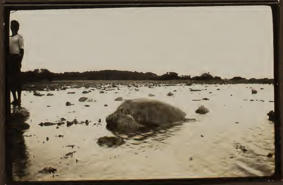
Golden Turtle 17 vii 25